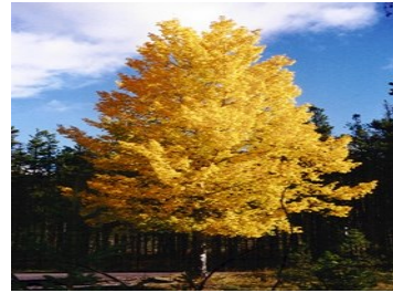
Aspen Class - Summer Term 2019

In Computing, we will be exploring spread sheets and how to use them to find answers to real life problems.